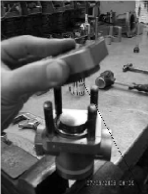
Remove cover nuts & cover.