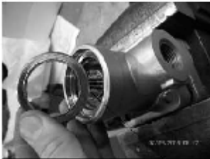
Inspect strainer cap gasket.