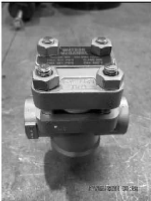
Remove trap from line.