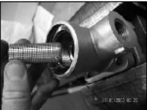
Inspect and clean strainer.