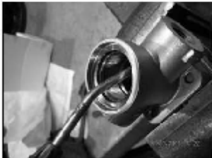
Blow any debris from body.

Reassemble after cleaning and inspecting all parts. Replace gaskets as necessary. Run a soap bubble test with low pressure air to confirm all seals are good before reinstalling in service.