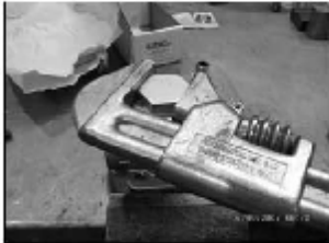
Remove strainer cap.