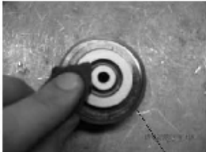
Clean seat with soft rag.