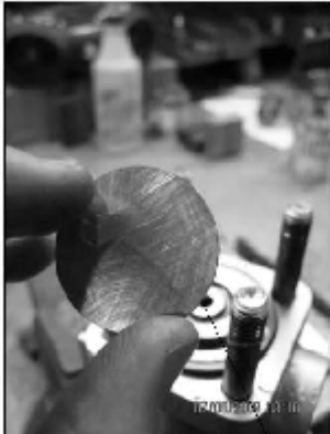
Inspect & clean disc.