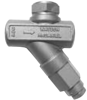
WD600SB Strainer & Blowdown Valve