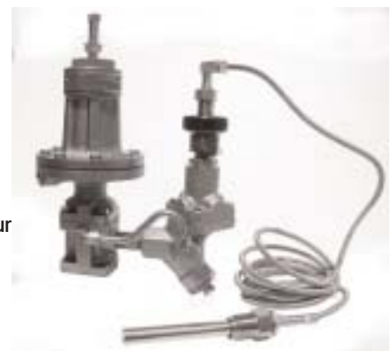
"PT" Pressure & Temperatur Pilot (optional)