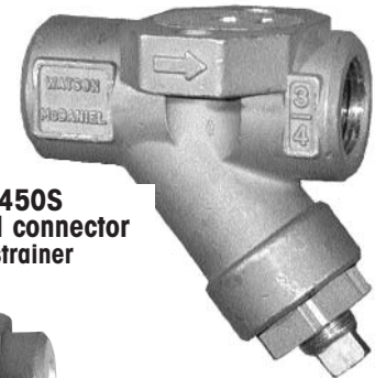
WU450S universal connector with strainer