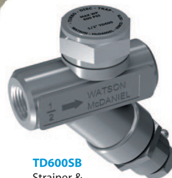
TD600SB Strainer & Blowdown Valve